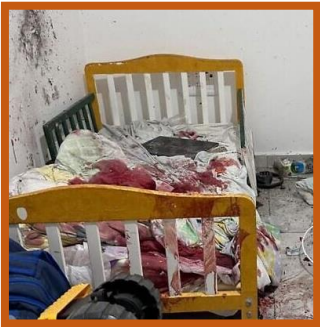
A murdered child's bed at a kibbutz near Gaza