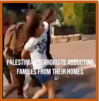
Hamas abducts Israeli civilians