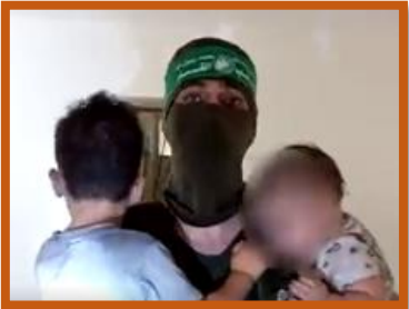
Hamas terrorist captures Israeli babies