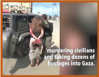
A bloodied and likely raped Israeli is taken to Gaza