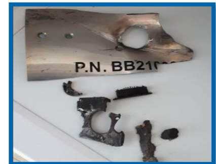
Iron dome casing and rocket fragments found at Chimes Israel early childhood center playgrounds and walkways in Ashkelon.