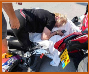
An Israeli mourns her murdered loved one