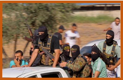
Armed Hamas terrorists in Israel

The devastation and destruction in Ashkelon and the surrounds is also horrendous. There are those whose homes have been hit by missiles. People are terrorized by fear.